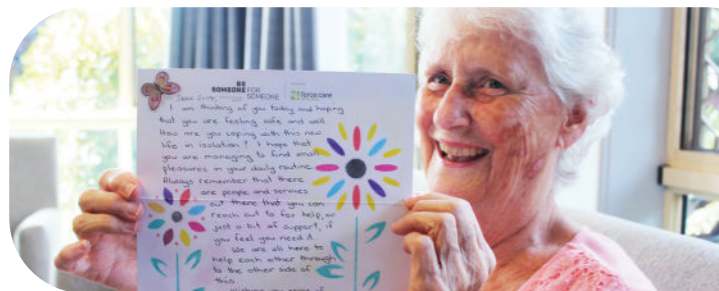
1,000 Notes of Friendship. Seniors receiving heartfelt well wishes through COVID-19.

Thousands of lonely isolated seniors felt the love of friends and strangers through our community based campaigns such as; More The Merrier Christmas campaign and 1,000 Notes of Friendship letter writing campaign.